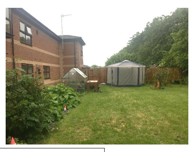
The garden is accessible to residents